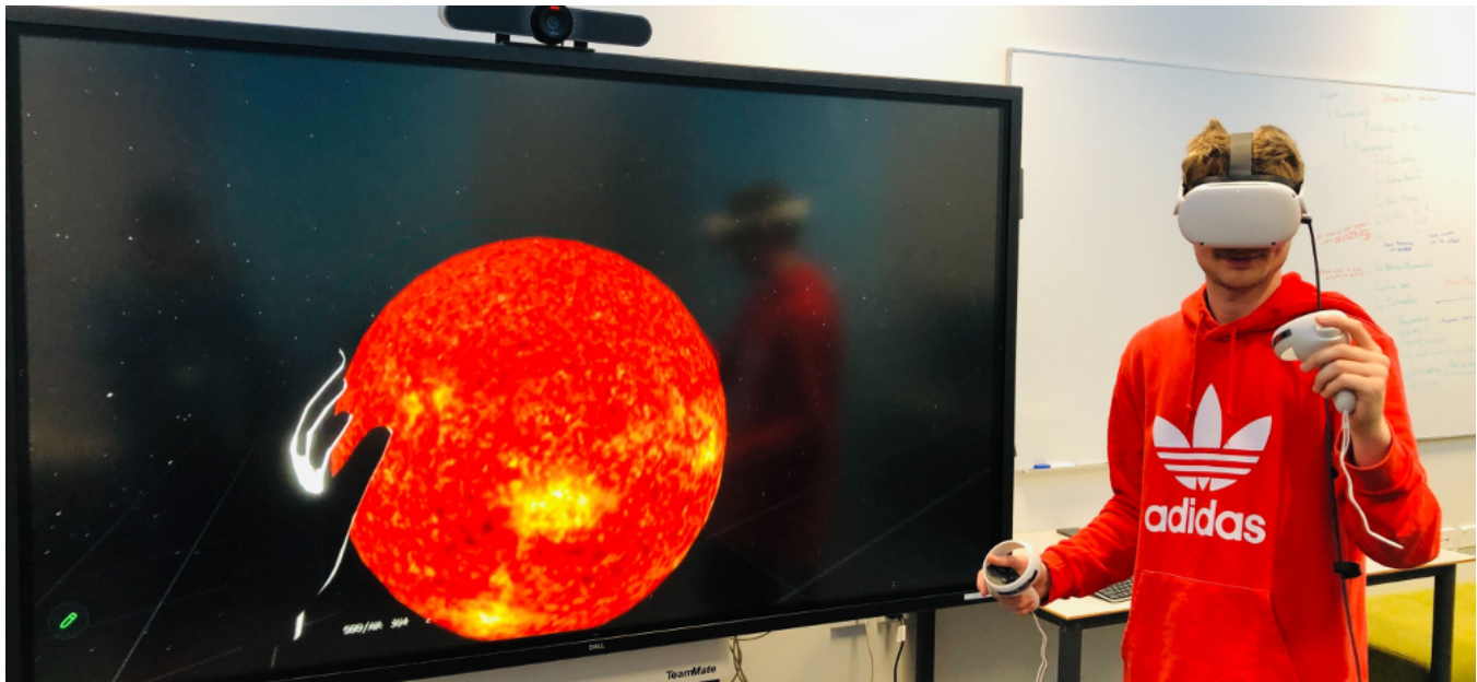
Figure 1: A prospective student exploring the Sun within SpaceVR using the Oculus Quest.