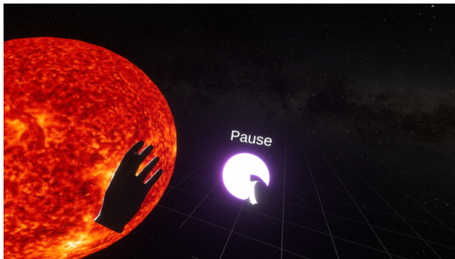
(b) Holding Control Item.