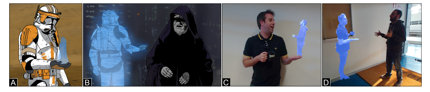
Figure 1: Volumetric projection-based telepresence in fictional visions of the future do not guarantee eye-contact. For instance, the character in (A) is looking down, while the character in (B) is looking forward, thus, their eye gaze does not match. We present a design space where (C) and (D) can communicate with eye-contact.

Joaquim Jorge INESC-ID, IST, ULisboa jorgej@acm.org