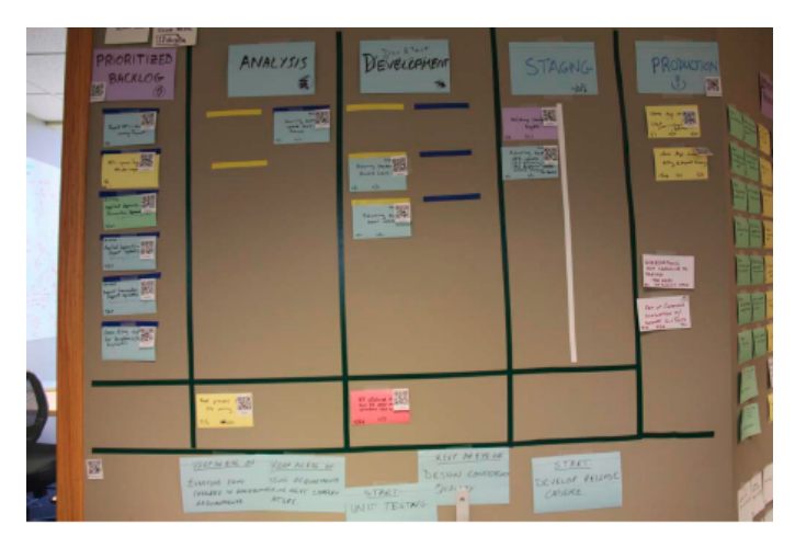
Fig. 4: Physical taskboard [40].

Other visualizations for progress tracking are concerned with the velocity of the team and estimating efforts. Sharp discusses different visualizations used to show the performance of the team for a period of time. This helps developers and managers to see the progress of the team, and it helps to estimate for the future. Agile teams use burn-up or burn-down charts to graphically represent the work achieved and the work left at a certain time in an iteration [29, 54]. These charts show the ideal and actual work done over a period of time, and indicate the performance of a team.