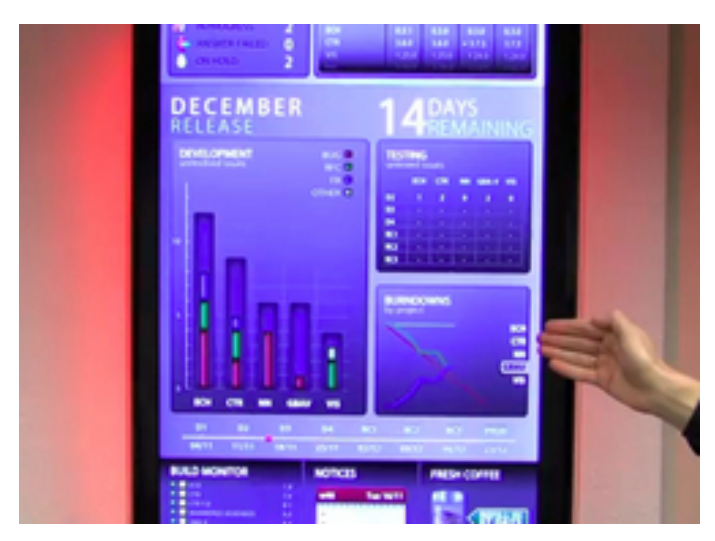
Fig. 3: Walle-D: An ambient display for Agile developers [14].

of awareness and it prompts developers to act on the conflicts that arise. Awareness 2.0 provides a high level overview using visualizations to detect bottlenecks, deadlines and tasks, which is similar to the information provided by Agile walls. On the other hand, FASTDash is more local in the sense that it allows developers to understand the context on which they are working. FASTDash makes the team more efficient because it encourages communication between team members who are working on similar areas in the project.