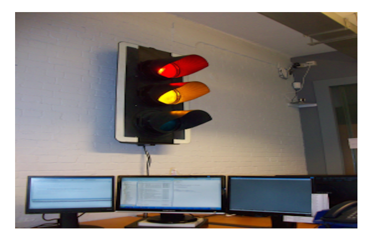
Fig. 2: Traffic light visualization for CI [4].

A development practice in Agile teams is continuous integration (CI). Since Agile teams work in small sprints, it is necessary for them to have working software everyday, and CI helps to make this possible. Automated tests are setup to